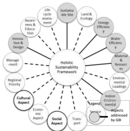
Figure 1: Seventeen aspects of criteria for holistic SAM framework

Poston et al. (2010) classified the 'shift' as the next generation of Sustainable Assessment Method (SAM) and derived the holistic framework for SAM based on a very comprehensive study of GBAT framework's aspects and criteria from fourteen countries. Refer to Table 1 and Figure 1.