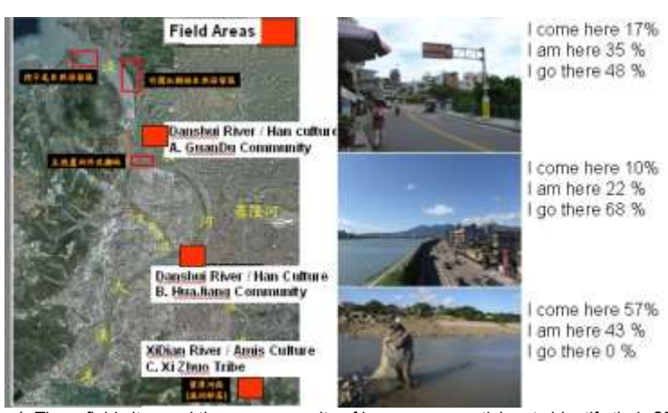
Fig. 1. Three field sites and the survey results of how survey participants identify their CES relationships with their neighborhood Danshui River.

At the beginning of the paper, I mentioned that Amis habitats locate close to waters, because of their strong aqua-related belief. When they migrate to cities, they search for riversides as their "loma" home. Due to the rapid urbanization and industrialization between the 1960s and the 1990s, many Amis had moved away from their tribal villages in Hualin to the metropolitan Taipei in the north (Fig, 1). According to Wu (2012) study, most of them served as low wage construction workers under harmful working conditions in society due to the inequality of opportunity for aboriginal socio-economic groups. Because of their low economic power, majorities of Amis people hardly afford the high rent and living costs in the urban area. They often reside in the temporary shed within the construction site.