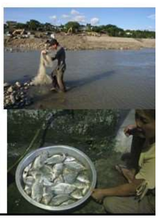
Fig. 4. The XiZhou tribe residents perform "mifoting" in the XinDian River.

Traditionally, areas along the river including the river consider as the tribal territories shared by everyone, especial male. They often go fishing in the shallow side of a river or stream close to home. Shallow water is important, because they often build some provisional barriers to catch fishes. Everyone shares these areas and fishing together. From a practical aspect, they still need ways to temporarily define which areas belong to whom when they go fishing together. During the fishing season or before the fishing festival, the senior male of the household would set a bunch of Miscanthus (a type of strong grass) to mark the center of his temporary fishing territory. Therefore, others would not interfere with this fisherman. This way could also prevent the area from overfishing and sustain the fish sources of their home river.