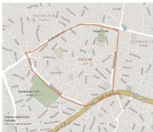
Figure 2: Location of Chizar in Tehran (Tehran.ir)

Chizar local community locates in the northern districts of Tehran. From the beginning, the border around this local community has formed the triangular shape. Chizar is among other old local communities of Tehran; however, it has a high religious privilege, as two famous shrines are attracting pilgrim and gives a particular identity to Chizar community. Fertile soil and two aqueducts are other reasons of forming this community.