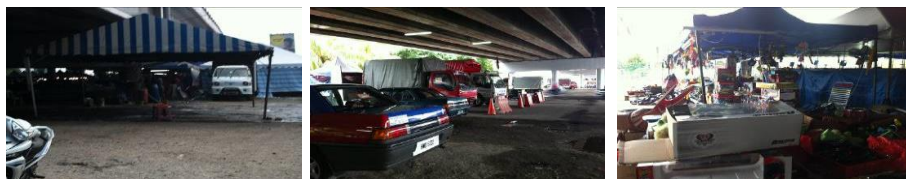
Fig. 7. Business and services offers under the MRR2 flyover include (a) evening to night time carwash service; (b) movers and lorry service; (c) toy stall and used clothes (bundle) stall.