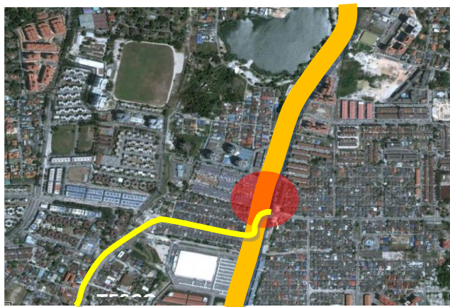
Fig. 1. The location of the study area under the flyover of MRR2 at Jalan Kanan 1.

The MRR2 or Kuala Lumpur Middle Ring Road 2 stretches 35 kilometre, was a project of Public Works Department (PWD) which provides connection to various highways in Kuala Lumpur and Selangor. For its construction, some squatters have been relocated especially around Ampang, Pandan and Cheras areas. Under the MRR2 lies Jalan Kanan 1 that connects to the immediate surroundings of Kampung Pandan Luar and Kampung Pandan Dalam which shares facilities and amenities on both sides, such as the food court and eatery, schools, religious facilities, commercial and offices. The compact grains of both areas lack the foremost important amenity, namely a public open space where freedom and various activities could happen. This could be one of the contributing factors which pilot the use of the leftover space under the flyover apart from its strategic location and historical background.