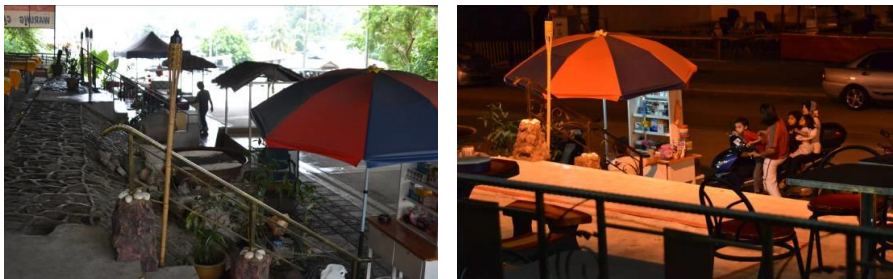
Fig. 4. Linear row of stalls where some operates during (a) day and; (b) some at night under the Penchala Link flyover.