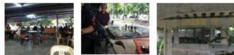
Fig. 6. Recreational activities (a) under MRR2 occur beside the cafe such as ping pong, carom and (b) chess games. (c) Extreme sports of paintball bunkers are isolated from the cafe but connected visually. The sport only takes place during weekends.

Under the flyover of MRR2, activities of chess playing, carom and ping pong takes place beside the café, often receive and produce cheering, inviting participation of other people, as spectators. Under the Penchala Link, extreme sports of paintball is set approximately 100 meters from the Apek Corner cafe happens during weekends. Leisure activities take place inside Warung Cherry areas