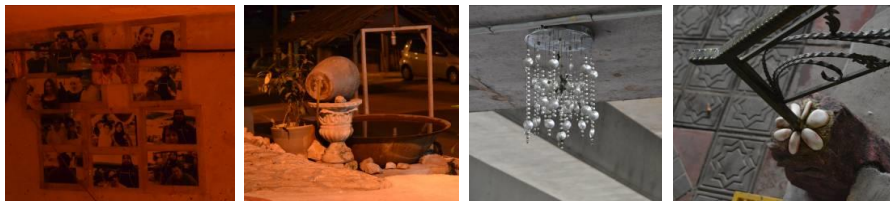
Fig. 12. (a) Photographs pasted on the walls; (b) landscaping; (c) chandelier; (d) detailing beautifies the leftover space under the flyover of Penchala Link where a strong sense of community ownership could be felt.

leisure, recreational activities, business and occasional weekly activities. In order to create places with identity, activities that are distinctively unique to that area should be encouraged. To understand further the opportunities that stimulate activities, research on the physical characteristics, and the complexity of community background need to be conducted.