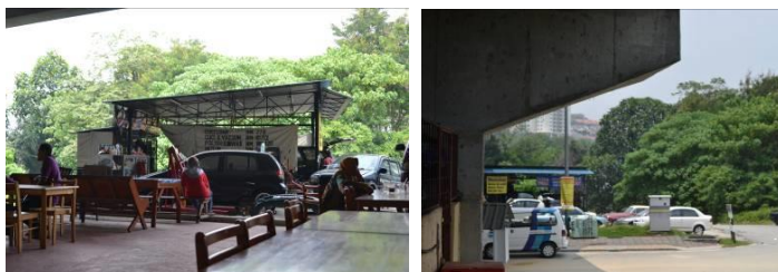
Fig. 8. (a) Carwash and (b) workshop services are provided under the Penchala Link flyover.