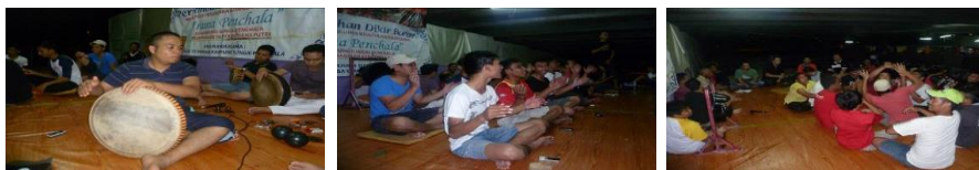
Fig. 11. (a) Traditional music instruments – komping, rebana, gong and others are being used; (b) tukang karut leads and follows by others in unison of voice and upper body parts movement; (c) a friendly match of dikir barat enliven the leftovers space.