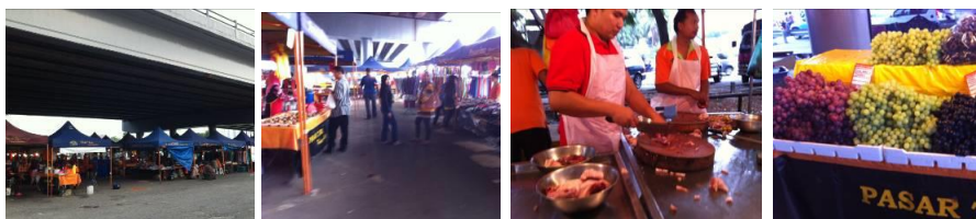
Fig. 9. (a) Evening market activities creates a lively ambiance on the leftover space where (b) meeting other member of community happens while shopping for groceries, (c) fresh chicken, meat, fishes as well as, (d) fruits and others.

Evening market ( pasar tani ) is held twice weekly under the MRR2 flyover. The colorful atmosphere of goods such as fruits, meat and fish, shawls and food transformed the ambiance of this leftover space into spaces for interactions and chatting where neighbours and friends bump into each other and the sidewalks act as seating apart from fulfilling their need to do grocery.