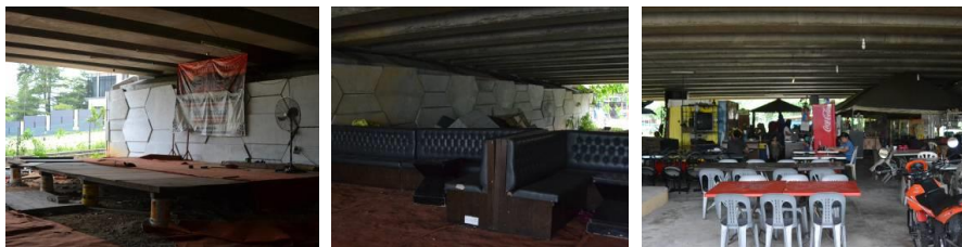
Fig. 10. (a) Temporary stage for in expensive material; (b) sofas are arranged for the convenience of spectators, (c) view towards the cafe seating's from the stage.

karut , members and traditional music instruments. The cultural activities require approval from the Rukun Tetangga Kampung Sungai Penchala and usually in collaborations with the owner of the cafe Warung Cherry and clubs such as Kelab Jaguh.