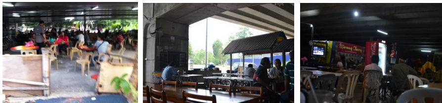
Fig. 5. (a) Mai Sembang Kopitiam cafe under the MRR2 in the evening; cafe under the Penchala Link (a) in the morning Apek Corner (b) and at night Warung Cherry .

roti canai stall operates in the morning. Movements of people that come and go, stopping to choose their meal contribute to the vibrant atmosphere. In the evening when Apek Corner closes, the cafe activities shifted to the opposite Warung Cherry which offers ala carte menu, strengthen by entertainment such as watching television, alternate weeks of dikir barat performance and paid karaoke sessions.