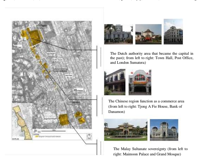
Figure.2: Research area